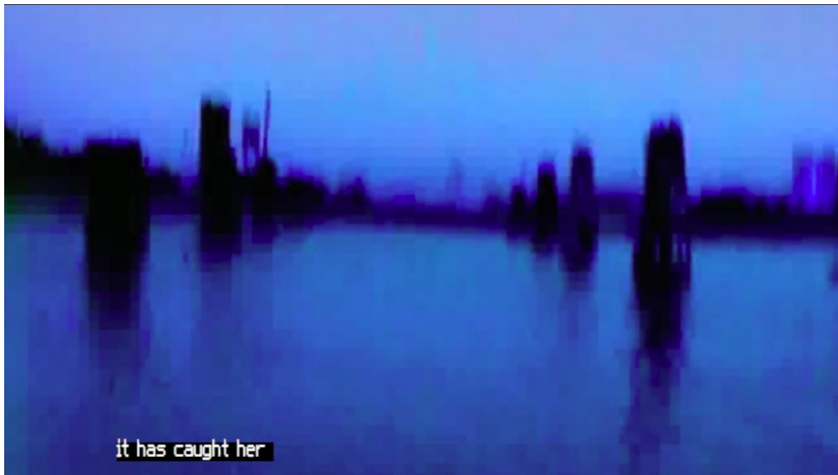
Figure 6: Rosa Menkman (2010–2012), Collapse of PAL .

These desires for the glitch challenge the Enlightenment narrative of history as the overcoming of errors and the future as progress away from the mistake-ridden past, turning error instead into a powerful poiesis that challenges regimes of control. Yet we should remain mindful that, not least in recent years, error is also an approach that can find itself in alliance with political economies in which performances of critique are praised as ventures whose pursuit promotes and strengthens the economy. Silicon Valley’s fetishisation of failure is a case in point (Harvard Business Review 2011). Errors can even be seen as a crucial computational function whereby machines used for algorithmic securitisation can learn more accurate methods of control. From this perspective, the subversions that lend agency to those subjected to the uncertainties of big data