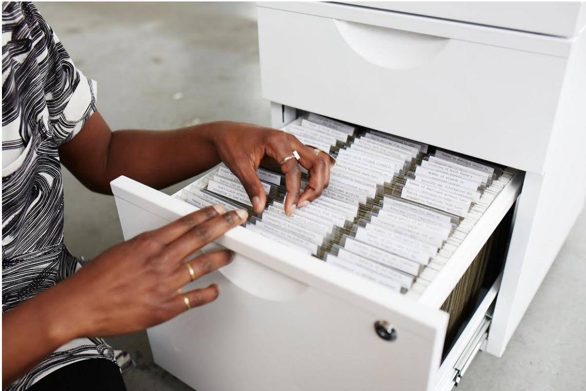
Figure 1: Mimi Onuoha (2016), The Library of Missing Data Sets .

Or take one of the most persistent tropes of data discourse: the black box. In mid-twentieth-century metaphorical terms, the black box is the paramount symbol of that about which we can only know the input and the output. It has come to represent what we do not—or cannot—know. The black box expresses not only the unknown and unknowable, but also the human desire to know more, to make the opaque at least predictable, if not transparent. It is a question of how we cope with the invisible—with that which has a presence, yet which is not present or comprehensible with the tools at our disposal (Steiner and Veel 2018). Viewed in this way, the question of the unknown is also a question of methodologies—of the tools available to us to understand the world. Paradoxically, the new archival mapping mechanisms embedded in big data have not only created new forms of knowing and predictability, they have also given rise to new modes of unknowing (Rosenberg 2014; Murakami Wood 2015).