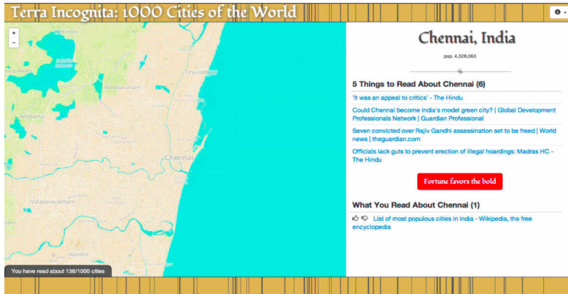
Figure 4: Catherine D'Ignazio (2014), Terra Incognita: 1000 Cities of the World .

Just as ideas about truth and error have been increasingly secularised, big data corporations are troubled by the same questions as Enlightenment thinkers: how to distinguish unproductive or aimless wandering from an adventure that might lead somewhere worth going? Today this becomes a question of how machines learn to detect information-bearing patterns from distracting noise.