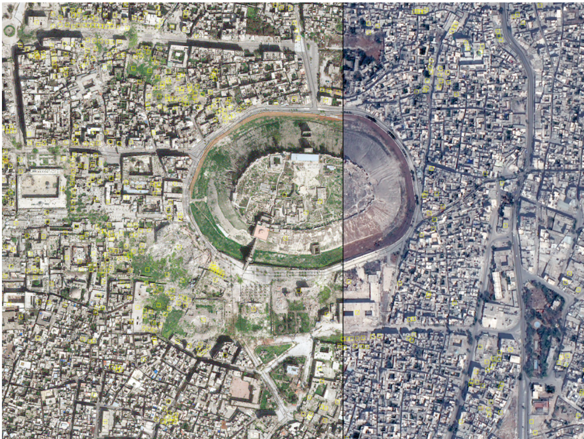
Figure 2: Laura Kurgan (2015–2017), Conflict Urbanism: Aleppo . Two satellite images of Aleppo's Citadel and surrounding neighbourhoods on March 23, 2016 (left) and September 3, 2015 (right). Yellow squares indicate damaged sites identified by the United Nations in May 2015. Additional unmarked damaged sites are also visible.

Lastly, we need to consider the temporal coding of the affective reactions of the unknown and the unknowable: the fear or allure of unknown future knowledge that we do not know whether we desire or hate because we do not yet know what it entails. Or the knowledge that in hindsight we regret having come to know and that we cannot make unknown again. This is brought out, for example, in architect Laura Kurgan's (2015–2017) interactive mapping project Conflict Urbanism: Aleppo , which seeks to map the devastation wrought on the city during the current civil war, while simultaneously archiving the cultural sites and neighbourhoods that were present before the conflict began (Figure 2).