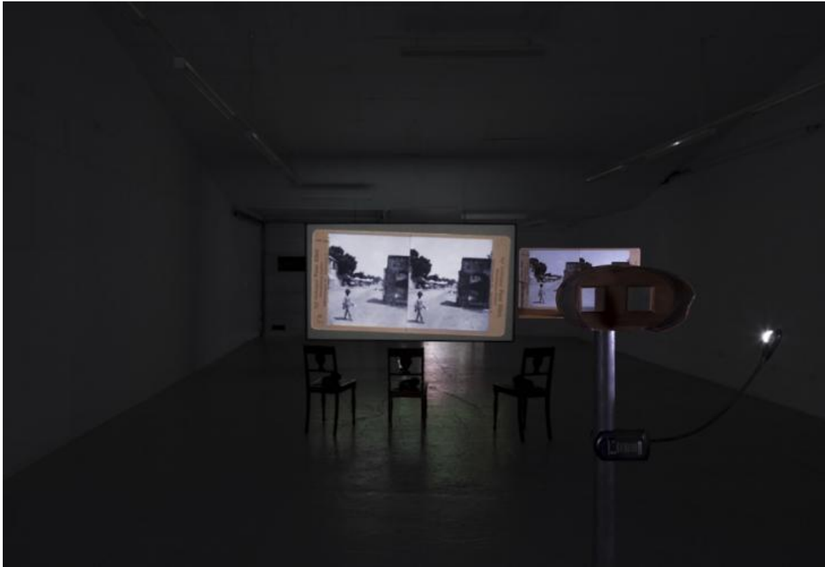
Figure 8: Katrine Dirckinck-Holmfeld (2017), The Christmas Report & Other Fragments (installation view).