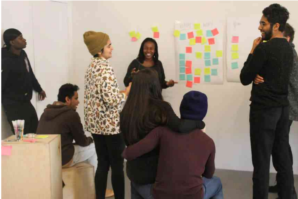
Figure 7: Stephanie Dinkins (2017), Project al Khwarizmi .

These questions recentre the archival tension between capture and exclusion, that is, the dangers of being both included and excluded by data gathering processes, how datafication amplifies the commodification and visibility of specific bodies (Sutherland 2017b; Noble 2018), and how big data archives are embedded in historical relations of racial capitalism. Such issues are addressed by La Vaughn Belle's (n.d.) artistic work, which uses the framework of the ledger to add alternative records to the archives of colonial history in the US Virgin Islands, while also exploring material remnants of colonial times that shed light on current capitalist extractive practices (see Navarro 2018). The temporal continuum between the archives of the past and the data archives of the present is also explored by Katrine Dirckinck-Holmfeld (2017), whose video installation "The Christmas Report & Other Fragments" engages with the temporalities of the colonial archives of the US Virgin Islands once they become digital, while trying to attune to the bodies, voices, and movements of those recorded by the archives through the Afrofuturist figure of the Data Thief (Figure 8).